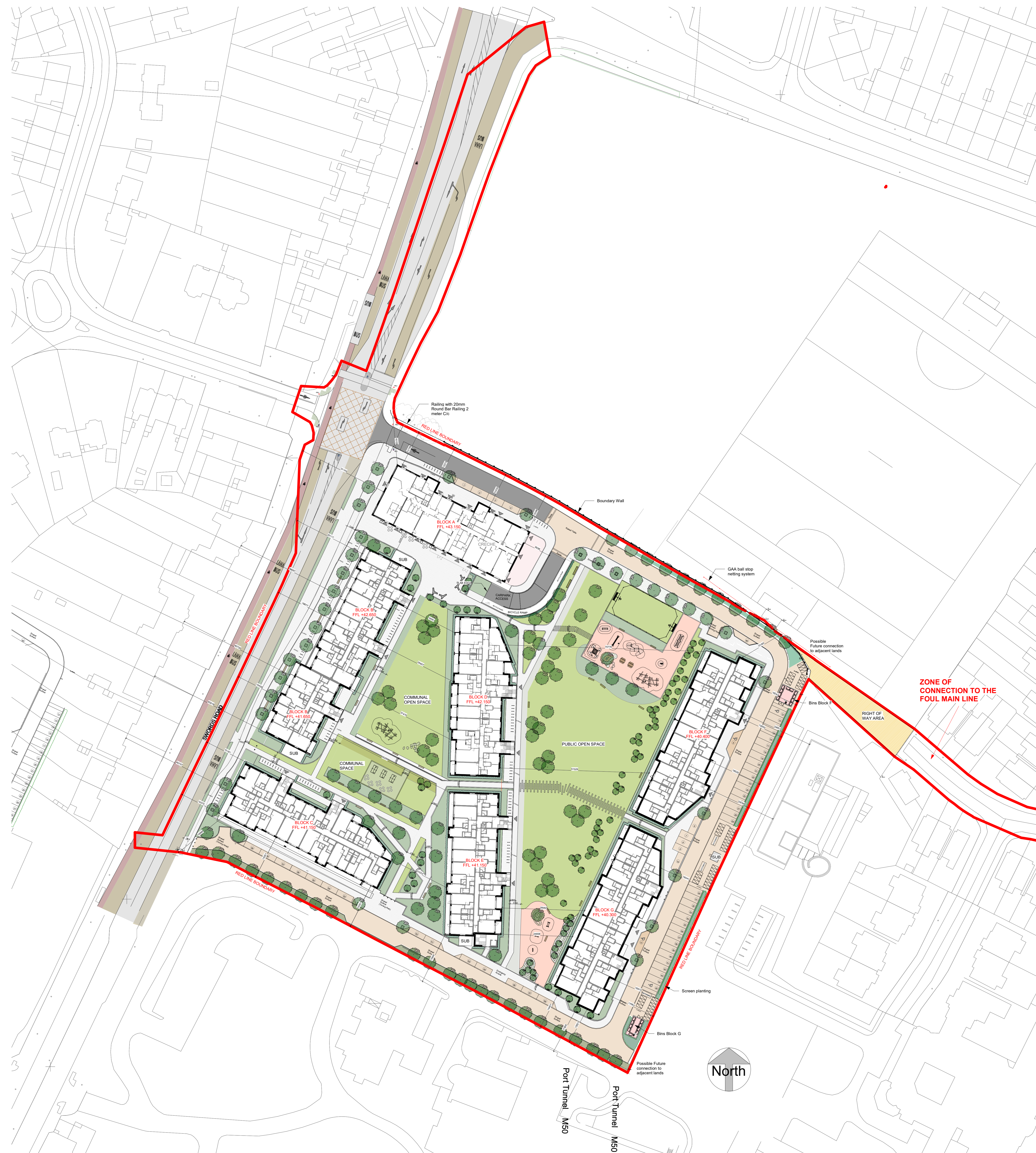
1 SITE PLAN 1:500